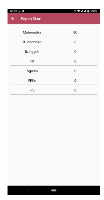
Figure 8: Scoreboard Page