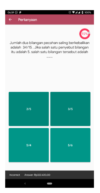
Figure 6: Question Page

Figure 6 is an example of a question from a math lesson. There are four answer options available. The user only clicks on the answer that is considered correct. The right side of the corner shows the remaining time to prepare all questions in BelajarKuy system.