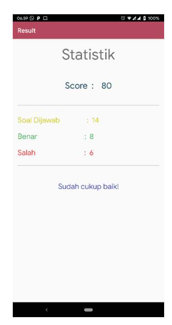
Figure 7: Result Page

After a user completes all quiz questions in BelajarKuy , the results are exposed containing several questions have been answered by the user. Eventually, a user knows number of correct and wrong answers as shown in Figure 7. Whereas, scoreboard represents the value received by user for all subjects that are illustrated in Figure 8.