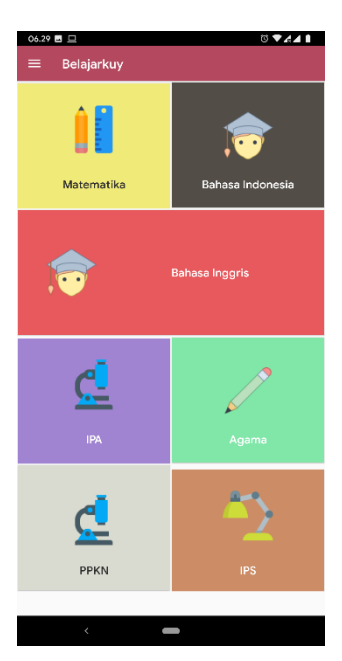
Figure 5: Main Menu Page

Figure 6 is an example of a question from a math lesson. There are four answer options available. The user only clicks on the answer that is considered correct. The right side of the corner shows the remaining time to prepare all questions in BelajarKuy system.