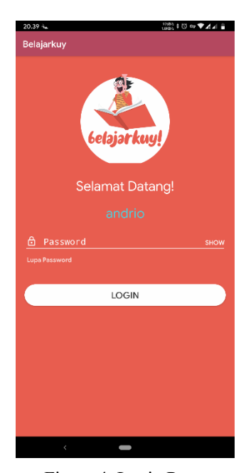
Figure 4: Login Page