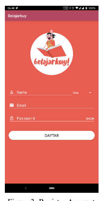
Figure 3: Register Account

Before starting BelajarKuy , a user is asked to create a new account as shown in Figure 4. If a user already has an account, then a user is required to enter Identity (ID) and password. If a user forgets the password, BelajarKuy will reset the password via an email that has been registered by user as shown in Figure 3.