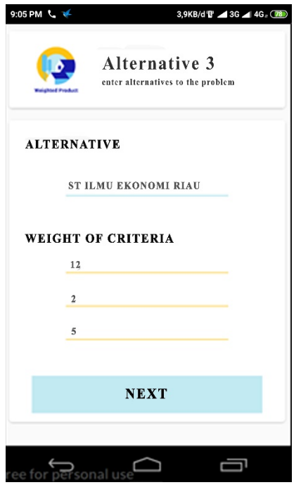
Fig. 6. Input Page 3

Therefore Figure 4, Figure 5 and Figure 6 represent three (3) name of universities as choices that is filled by user. User can input three (3) universities that wants to be registered.